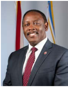
Orange County Mayor Jerry L. Demings